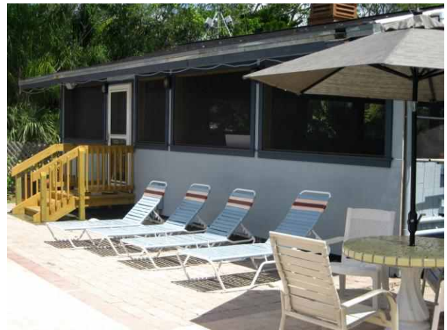
Pavilion Front Repair Completed