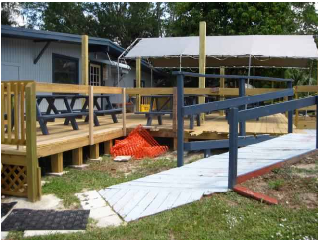
Progress is evident on the Restaurant Deck