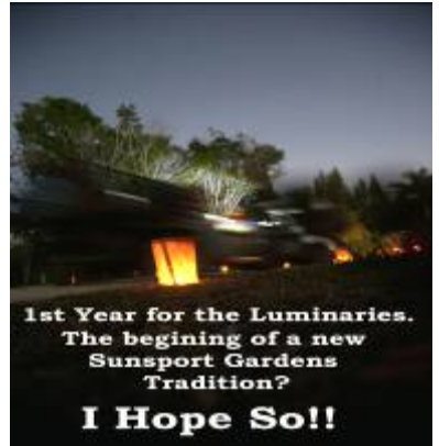
New Years Eve at Sunport Gardens