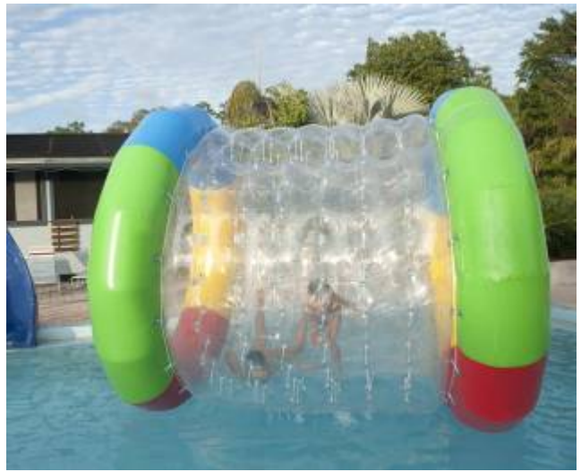
Human Hamsters in the New Hamster Wheel Pool Toy